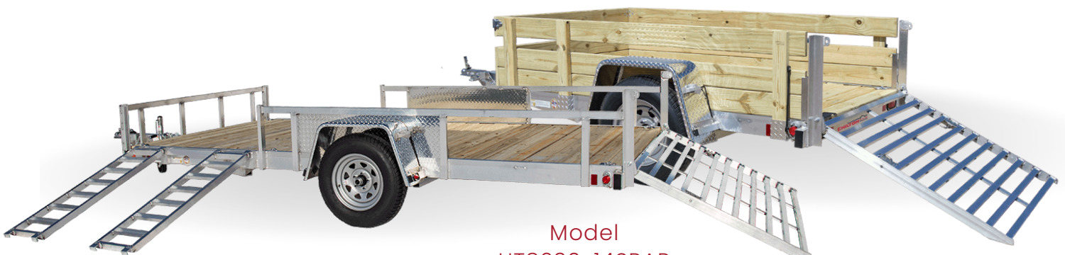
Model UT8230-14SRAR with side load ramps