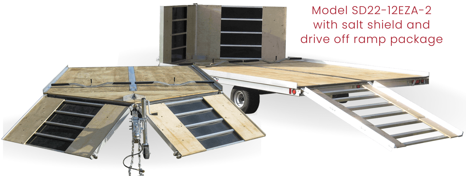
Model SD22-12EZA-2 with salt shield and drive off ramp package

8.5 ft x 20 ft, deckover utility (no snowmobile tie-down bars), 2999# GVWR