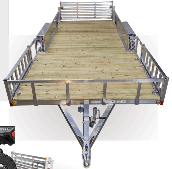
Model UT8250-17BSRAR with bump-out and bi-fold ramp upgrade