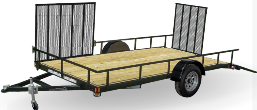
Model HH3000R-BT14 with side load ramp