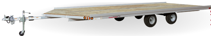
Standard Model XX10130-20A-2D

Single & Tandem Axle V-Front (continued)